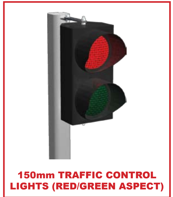
150mm TRAFFIC CONTROL LIGHTS (RED/GREEN ASPECT)