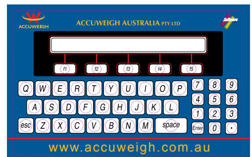
KEYBOARD AND DISPLAY