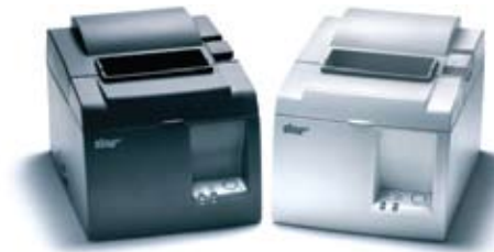
STAR MICRONICS TSP143U

Standard DCS does not include mounting and brackets. All enclosures are powder coated sheet steel. Stainless steel (SS) enclosure and SS weather hood shroud are also available.