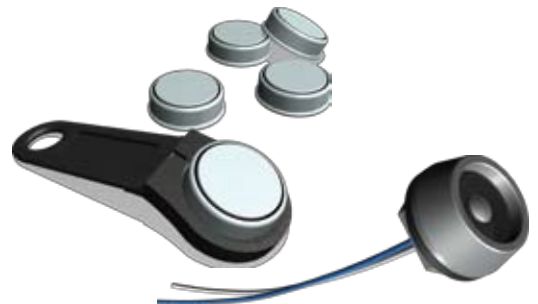
DALLAS i-BUTTON TAGS, TAG HOLDER AND TAG READER